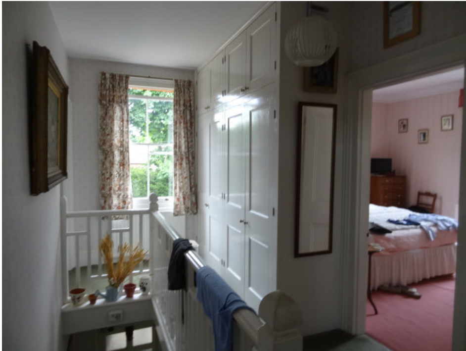
The landing. The staircase originally continued to provide access to the roof.