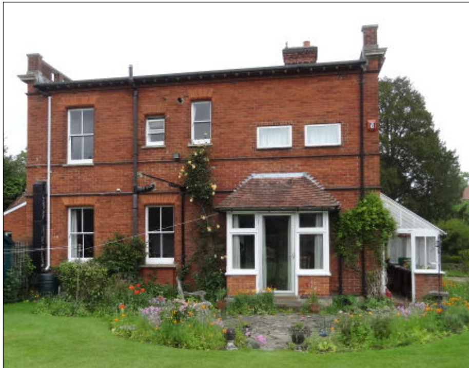
The rear of the building as it is today without the safety railings.