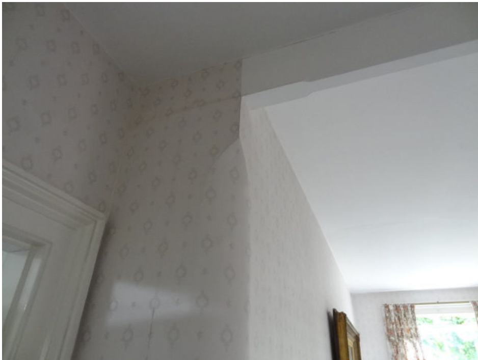
Chamfers and stops in the walls and woodwork on the landing