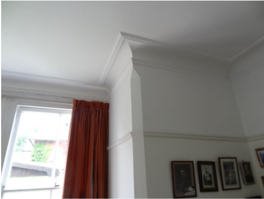
Further chamfers and stops in the woodwork and walls in the Garden Room