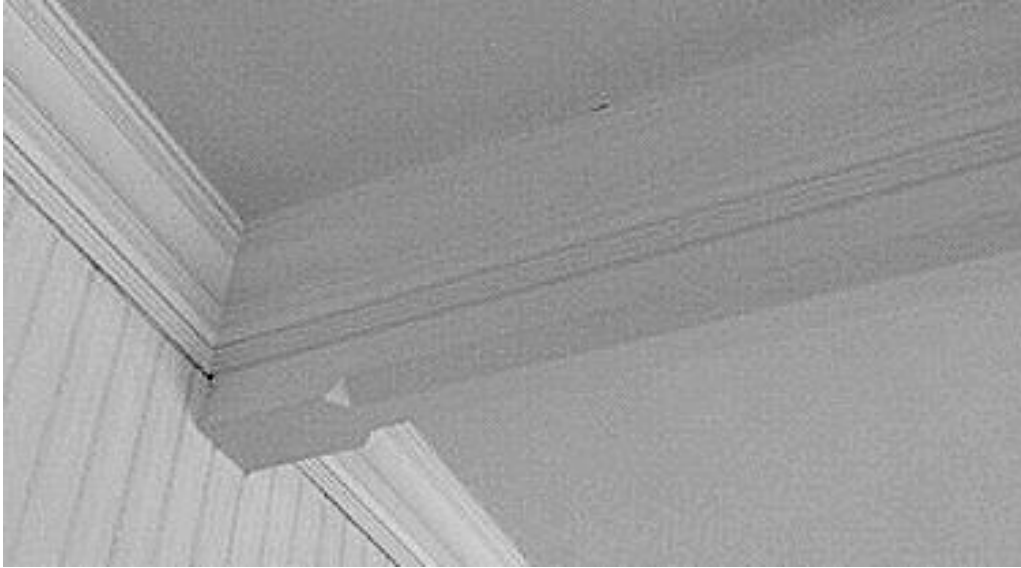
Beam with chamfers and stops in the front reception room (best in black & white).