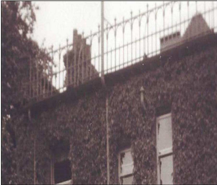
The rear in greater detail with the safety railings in position.