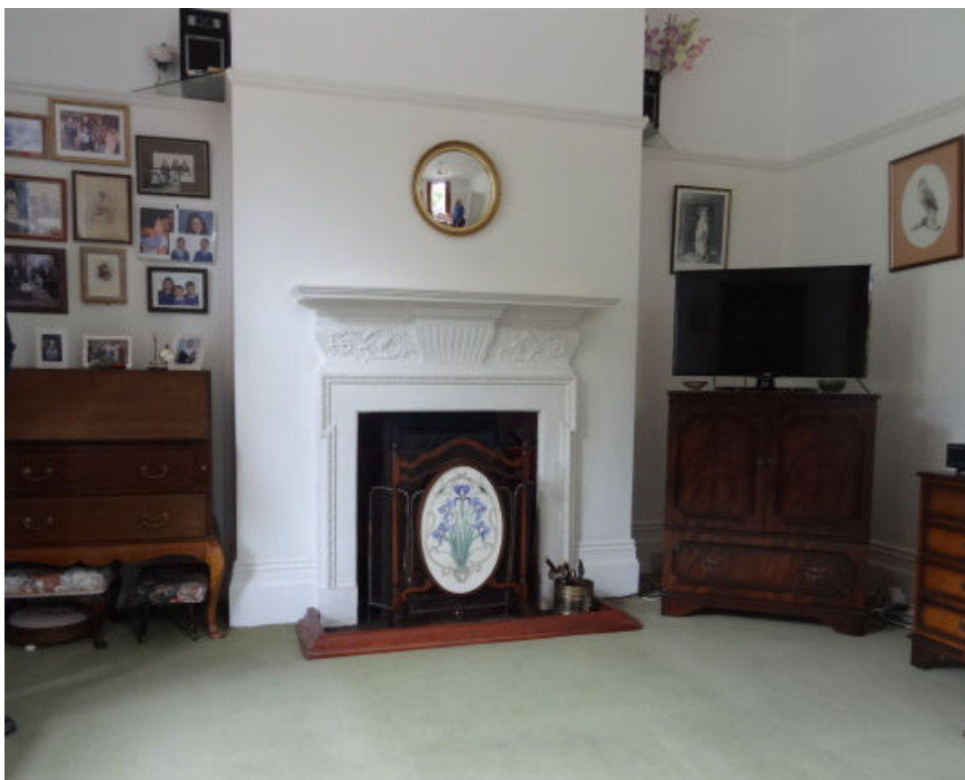
The White fireplace on the Ground floor front reception room.