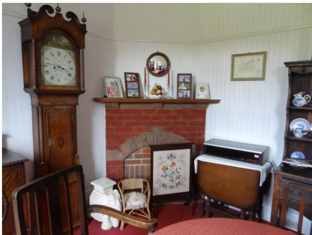
The brick fireplace in the rear reception room.