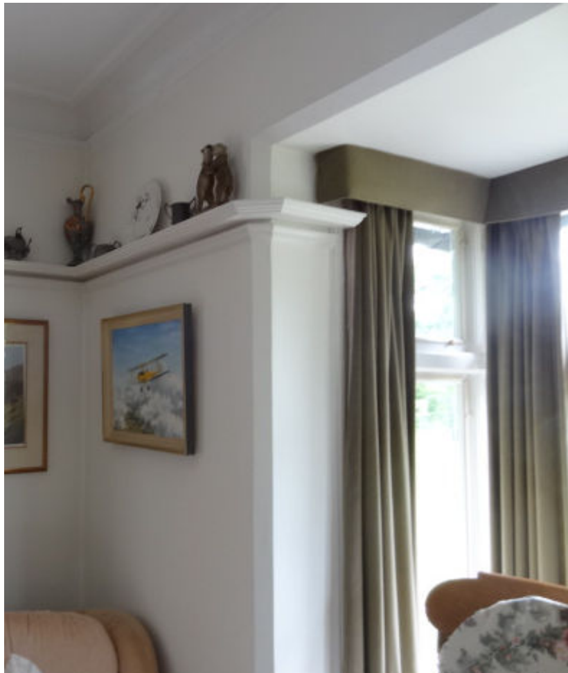
The chamfers and stops in the woodwork and walls in the Garden Room